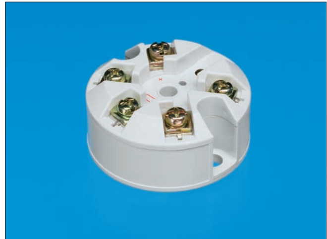
Push Button Temperature Transmitter

A complete data sheet with input and output specifications is available by contacting SS&C Engineering.