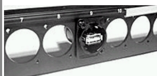
Unloaded 1 RU EH Rack Panel

Note: All panels come with cable tie bar