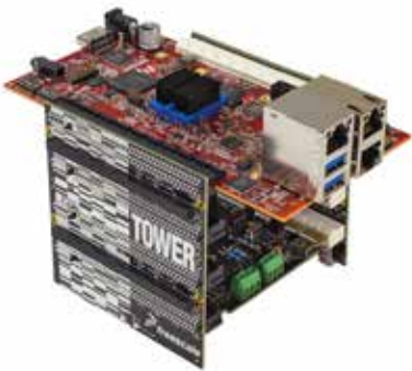
Figure 1. TWR-LS1021A module (TWR-LS1021A, TWR-SER-IO and TWR-ELEV)