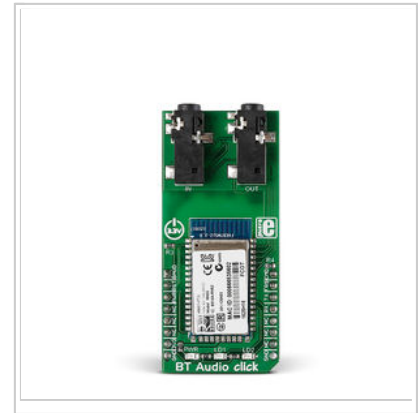
BT Audio click