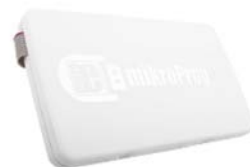
mikroProg™ for CEC