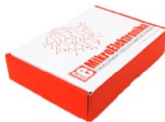
Damage resistant protective box

mikroProg™ is packed in the protective box along with the relevant documentation and product DVD. This box is very resistant to all kinds of damages and shocks. The package contains: