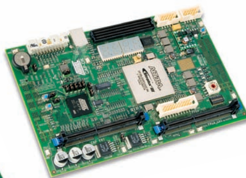
CAP9HA Mezzanine Board