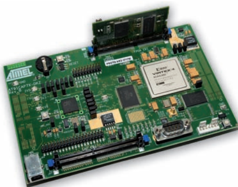
CAP7X Mezzanine Board