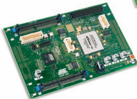
CAP9A Mezzanine Board