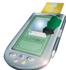
Personal Digital Assistant