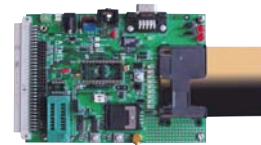
T8xC5121 Development Board

For more information, contact: cardreader@nto.atmel.com