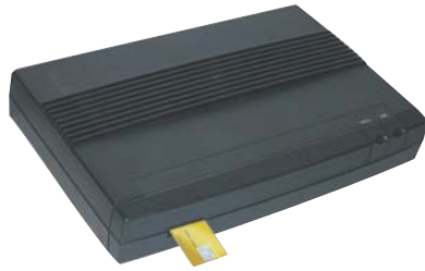
Set Top Box – TV – Game Console