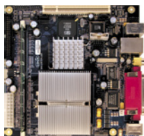
Custom Form Factor/ Mini-ITX SBC