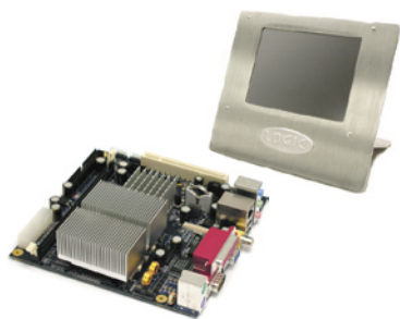
Logic Development Board / SBC (with Display Kit)