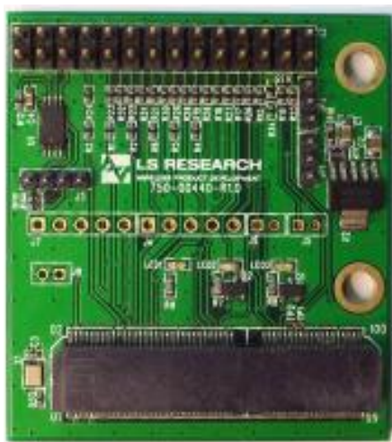
COM6L to BeagleBoard Adapter

The COM6L to BeagleBoard Adapter is designed for use with both the COM6L-T5 (TiWi5) Adapter Card and the COM6L-BLE (TiWi-BLE) Adapter Card.