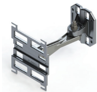
Standard Articulating Mount