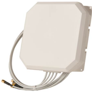
Patent Pending PSQ24495