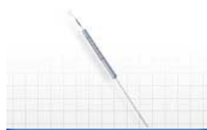
Push-Pull Precision Force