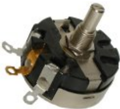
Representative photograph, actual product appearance may vary.

Due to regional agency approval requirements, some products may not be available in your area. Please contact your regional Honeywell office regarding your product of choice.