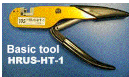
Hand tool body: HRUS-HT-1