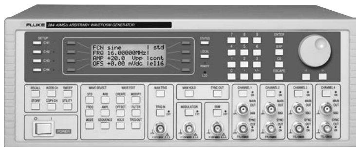
284 Waveform Generator

These universal waveform generators combine many generators in one instrument. Their extensive signal simulation capabilities include arbitrary waveforms, function generator, pulse/pulse train generator, sweep generator, trigger generator, tone generator, and amplitude modulation source.