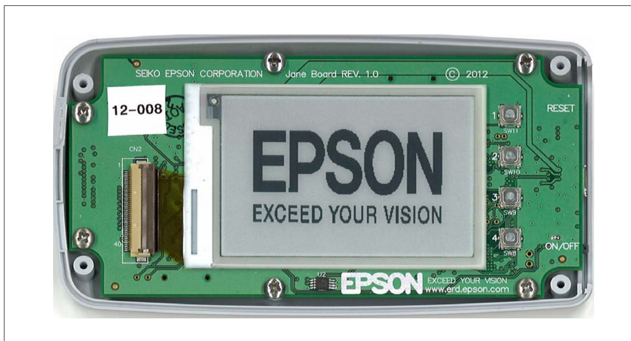
Figure 1-1: Jane-TCON EPD Demo Unit (Top View)

The unit is powered by an internal Li-Ion rechargeable battery or from a USB connection. The battery is charged by power from the USB connection. The unit has an Epson TCON, S1D13T03, and typically has mounted a 2.7" panel from PDI. The board can also use a 1.44" or 2" EPD panel from PDI. The main processor on the board is an Epson MCU, S1C17801, which has embedded an USB controller. The demos software, including the images are stored on a microSD card.