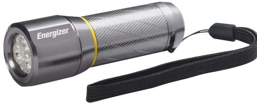
Tested according to ANSI/NEMA FL1 Standards. Results based on: Energizer ® MAX® Alkaline E92