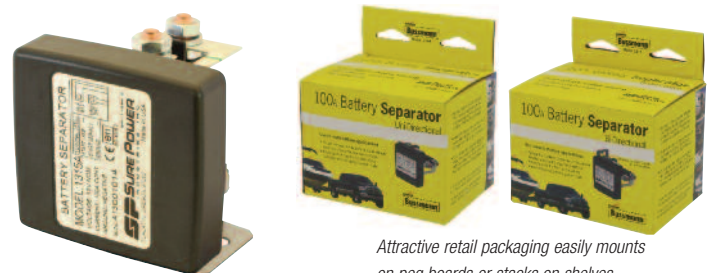
Attractive retail packaging easily mounts on peg boards or stacks on shelves.

* Use the catalog numbers to order these products.