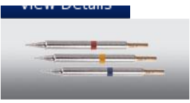
Replacement Soldering Tips K Series