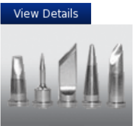
Replacement Soldering Tips W Series