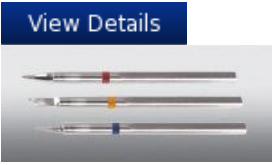
Replacement Soldering Tips S Series