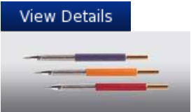
Replacement Soldering Tips T Series