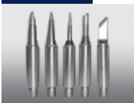
Replacement Soldering Tips H Series