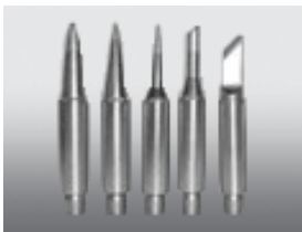
Replacement Soldering Tips H Series

Solder Soaker sponges are designed specifically for electronics.