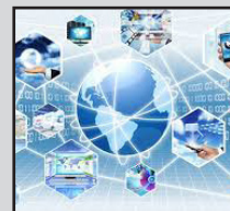
Internet of Things