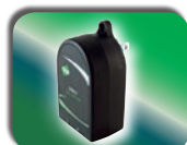
SE Range Extenders