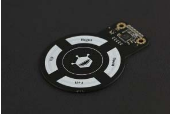
3D Gesture Sensor mini