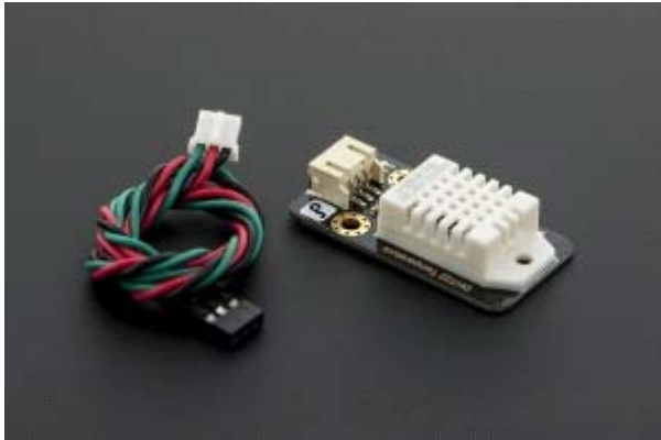
DHT22 Temperature and humidity module SKU:SEN0137