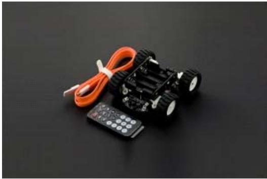
4WD MiniQ Complete Kit V2 (SKU:ROB0050)