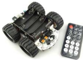
4WD MiniQ Complete Kit V1 (SKU:ROB0050)