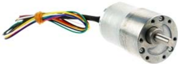
12V DC Motor 122rpm w/Encoder (SKU: FIT00403)