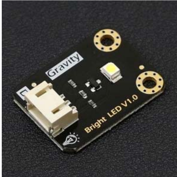
Bright LED Module SKU: DFR0438