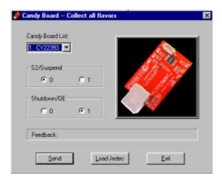
Figure 1. Candy Board Set-up Window

Windows is a trademark of Microsoft Corporation. CYClocksRT™ is a trademark of Cypress Semiconductor Corporation. All product and company names mentioned in this document are the trademarks of their respective holders.