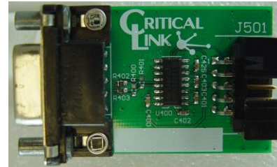
(1.8" x 1.2" – actual size)