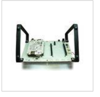
Mounted on Brackets