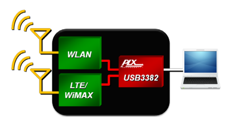
Figure 2: Creating a multi-function USB 3.0 device with two PCI Express based wireless radios and the USB 3382

The USB 3382 is designed to easily convert existing PCI Express endpoints/adapter cards to a standalone USB 3.0 product.