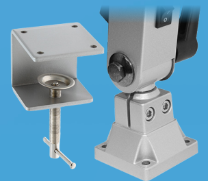
Heavy-Duty Mounting Clamp

The innovative ProVue Deluxe LED Magnifying lamp from Aven is the new standard in inspection lighting. This durable aluminum design features a 5 inch, 5 diopter glass lens for crystal clear, distortion-free viewing. Featuring 72 energy-efficient LED lights for shadow-free illumination.