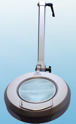
5 Inch/ 5 Diopter Lens 2.25x Magnification