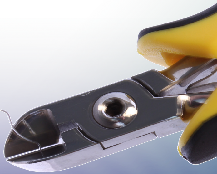
Tungsten Carbide Blades 79-80 HRC

Aven's Tungsten Carbide Oval Head Cutters are designed to cut through hard wires with ease. The tungsten carbide blades have a hardness rating of 79-80 HRC for exceptional durability. Applications include Guide Wires, Stents, Catheters and Single/Multiple Fillers. Available with Flush and Semi-Flush blades.