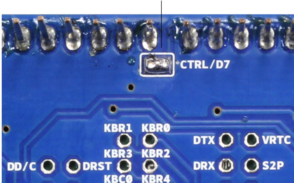
Bridged pin to automatically power the modem

Several of the modem pins are exposed on the underside of the board. These provide access to the modem for features like speaker output and microphone input. See the datasheet for complete information.