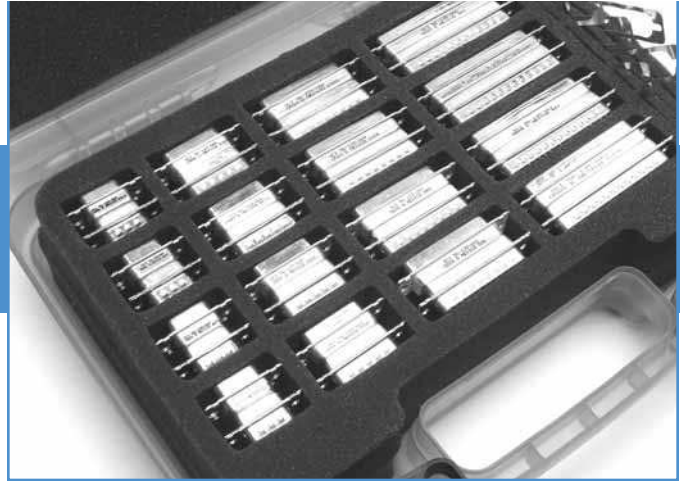
Adapter Test Kit