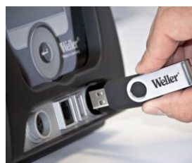
Multi-purpose USB port