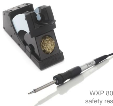
WXP 80 set with safety rest WDH 10

Order No. 0052921299 (0052921199 for pencil only)