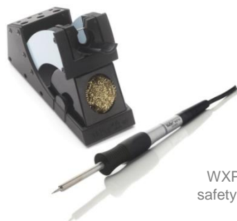
WXP 65 set with safety rest WDH 10