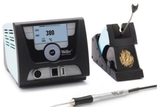
WX 1 control unit with WXMP Micro soldering pencil (40W / 12V) and WDH 50 safety rest