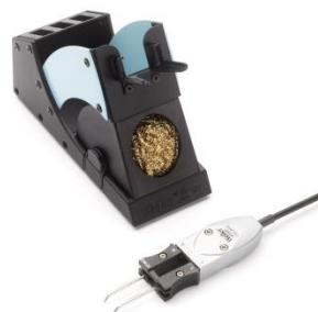
WXMT set with safety rest WDH 60

Order No. 0052920499 (0052920399 for pencil socket only)