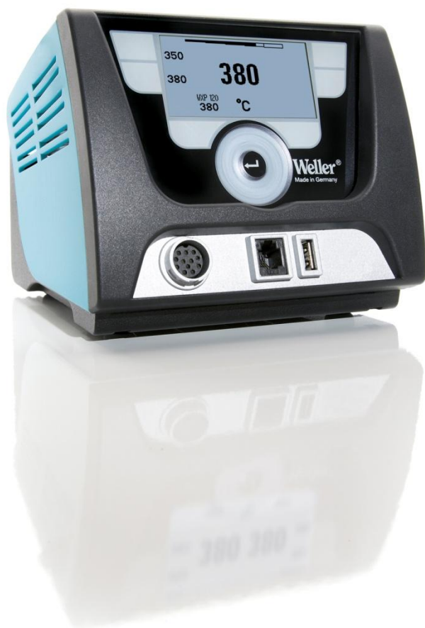
WX 2 control unit shown here

The new WX 1 control unit from Weller. A new era in soldering.