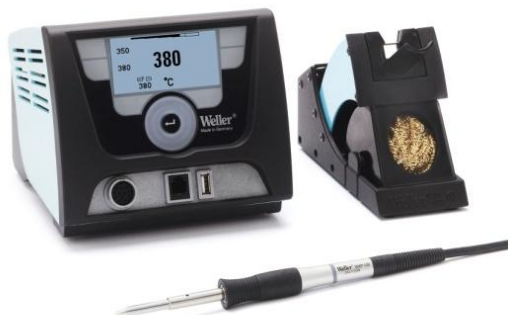
WX 1 control unit with WXP 120 (120 W / 24 V) soldering pencil and WDH 10 safety rest