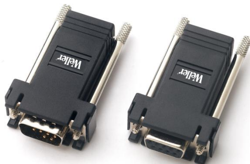
WX Adapter for PC Order No. 0058764711

Order No. 0052920999 (0052920899 for pencil only)