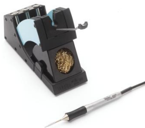
WXMP set with safety rest WDH 50

Order No. 0052920699 (0052920599 for pencil only)