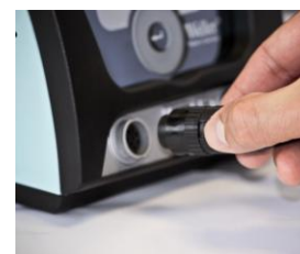
WX tool connection