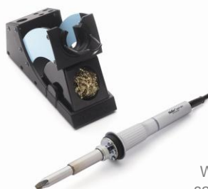
WXP 200 set with safety rest WDH 31

Order No. 0052920299 (0052920199 for pencil only)