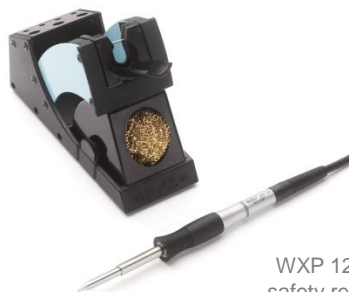
WXP 120 set with safety rest WDH 10