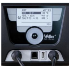
Multiple language menu navigation