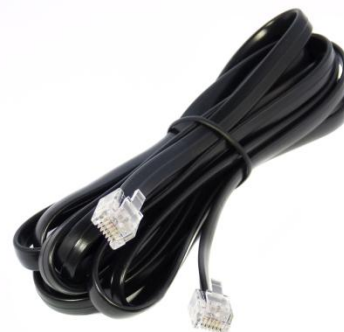
WX connection cable Order No. 0058764710