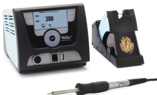
WX 1 control unit with WXMP Micro soldering pencil (40W / 12V) and WDH 50 safety rest