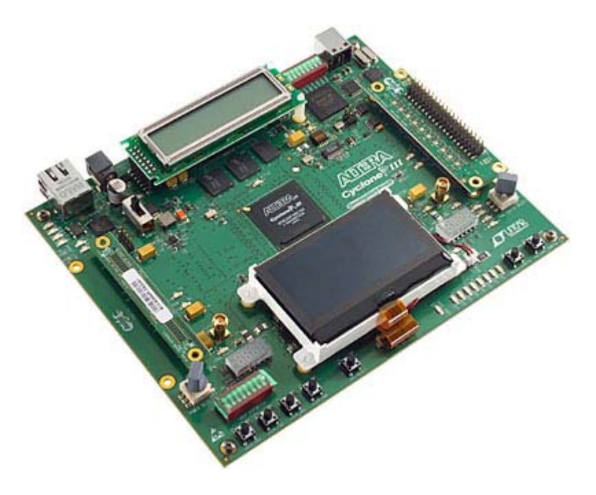
Figure 2 shows the data conversion HSMC.