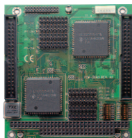
PCM-3643 4/8 RS-232 COM Port Module