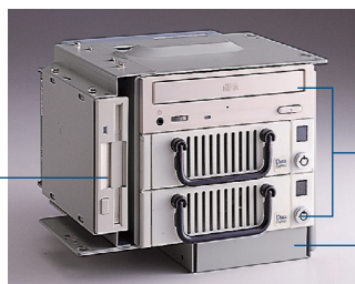
One 3.5" drive bay