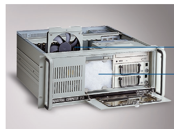
One 85-CFM hot-swap cooling fan