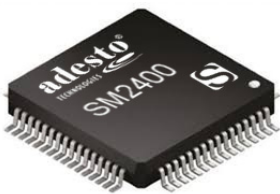
Figure 1. SM2400 N-PLC Transceiver