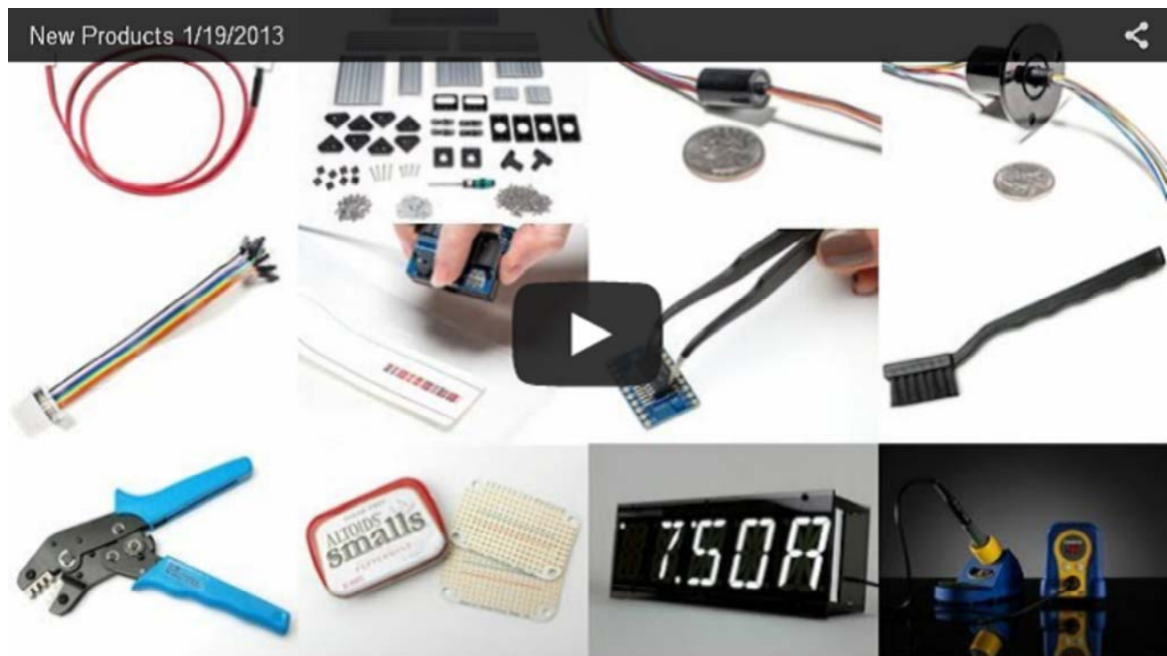
12-wire slip rings (3:42)

Inside the miniature plastic tube is a gold plated slip ring for 12 wires. There are twelve color coded wire sets made of 28 AWG and no matter how you twist the assembly, they will remain in continuity. Each of the wire sets can carry up to 2A at up to 240VAC or 240VDC. This model is the tiniest slip ring you can get, a mere 20mm long, 12mm diameter. Rated to rotate up to 300 RPM (but you can probably go faster if you don't mind a reduced life and/or noise).