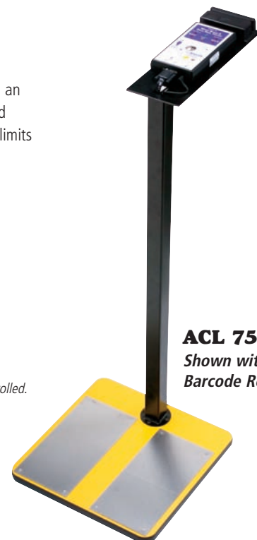
ACL 750 Shown with ACL 755 Barcode Reader

Display: Red and green LEDs, high dB buzzer, computer monitor (optional)